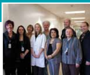
Building a Learning Centre to teach and train tomorrow's healthcare providers.