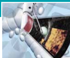
Purchasing new technology like an EBUS to diagnose lung conditions faster.